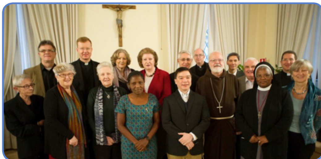
Pontifical Commission for the Protection of Minors

In 2014, Pope Francis appointed 17 men and women to the Pontifical Commission for the Protection of Minors. Comprised of lay, religious, and clergy from around the world, the purpose of the Commission is to act as an advisory body to the Holy Father on policies and educational programs for the protection of youth and vulnerable adults. The Commission’s tasks are to evaluate the programs and policies that are currently being used and to offer suggestions for new initiatives. Visit www.protectionofminors.va to view the Commission’s new website and learn more about their ongoing efforts.