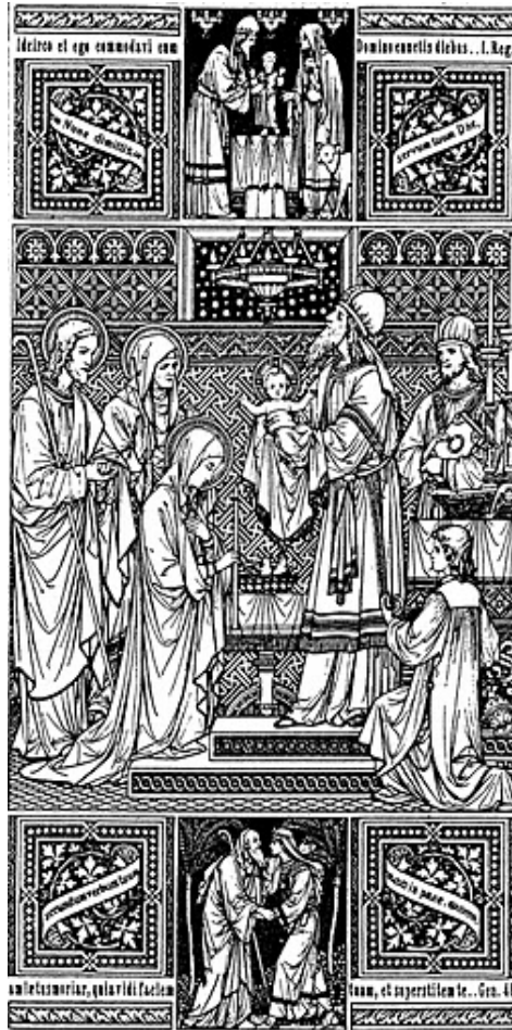
The Presentation of Jesus in the Temple

Diocese of Wichita , Office of Vocations