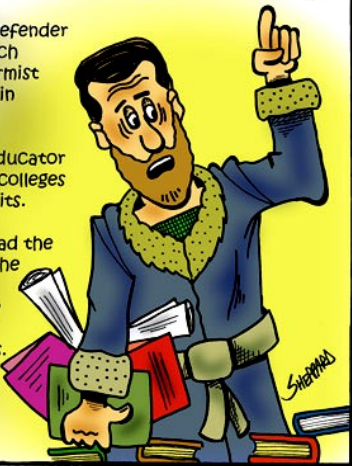
St. Peter Canisius