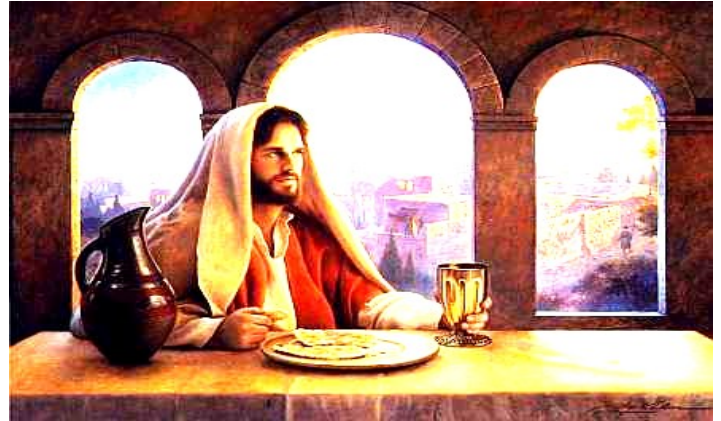
September Reflections of Eternity